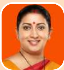
Smriti Zubin Irani Hon'ble Minister of Textiles Government of India

Technical textile is the fastest growing segment of the textile sector and its potential has been acknowledged by government and industry stakeholders alike. This platform created by Ministry of Textiles and FICCI has been an enabler for linkages, technology transfer, exchange of innovative ideas, joint ventures and showcase of what is happening around the globe in the field of Technical Textiles.